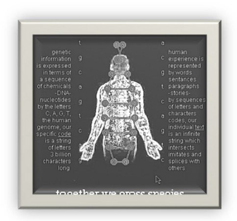
Figure 8: Carrier (becoming symborg) (1999)

These last two works show similar concerns to those discussed by N. Katherine Hayles in How We Became Posthuman (1999), namely that information/ knowledge cannot be treated as a disembodied entity, and that there exists an interactive dynamics between cognition, knowledge representation and memory with the material substrates that help support, carry and transfer these processes across space and time. Human memories are not only moved by linear conscious reason and abstract disembodied language. Unconscious and deeply emotional states, like those that enrich the lives of artists, carry memories in complex viraldream-like replicative patterns, virtually simulated yet embodied and enmeshed in the specificity of concrete time and place. No wonder the world of art is full of antiabecedarian desires.