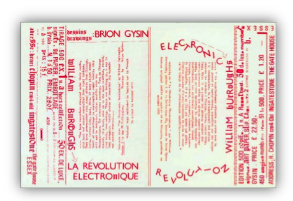
Figure 6: Original announcement of the release of The Electronic Revolution, designed by Brion Gysin, printed in red on a sheet of white paper, in both English and French.

The start of The Electronic Revolution brings as back to the Aleph and alphabetic writing only to subvert it: "In the beginning was the word and the word was god and has remained one of the mysteries ever since. The word was God and the word was flesh we are told. In the beginning of what exactly was this beginning word? In the beginning of written history." (n/p) The repetition of terms in this paragraph draws attention to the complex reading forms required to understand, however partially, works such as Joyce's Finnegans Wake or Borges "The Aleph". In fluid kinaesthetic texts meaning is not gathered from orderly linear structures. Rather, it derives from the repetitions and from the resonances echoing from these. The first part of The Electronic Revolution , "The Feedback from Watergate to the Garden of Eden," turns to the semantic theories of Alfred Korzybski. The sentence above uses Korzybski's words and de-semantizes them. Burroughs then goes on to define the written word as a virus that made the spoken word possible. Like alphabetic writing, exemplified in the symbol of the Aleph, virus are immortal and spread by symbiotically parasitizing living organisms and sometimes destroying them. Here is a passage from the text: